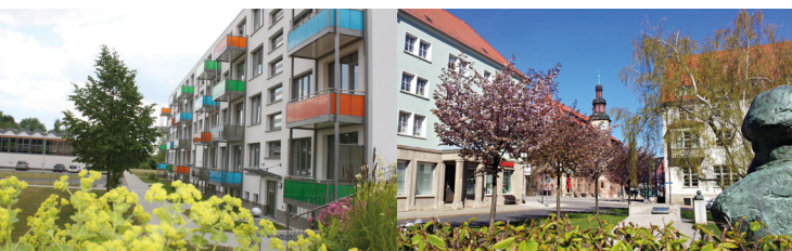
Hospital staff dormitory