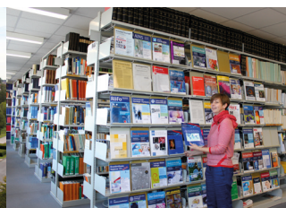
View into the medical library