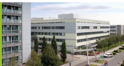
Entrance area to the hospital