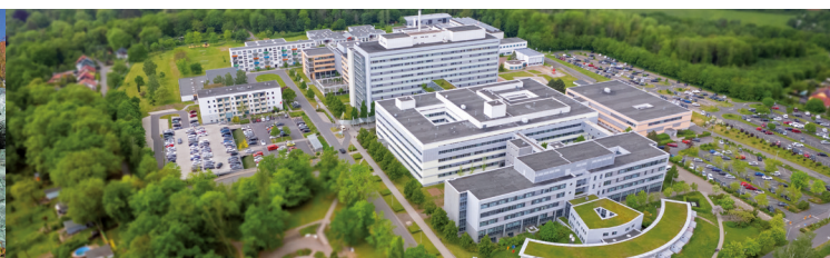
View of Nordhausen