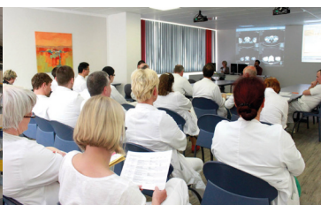
Weekly interdisciplinary tumor conference